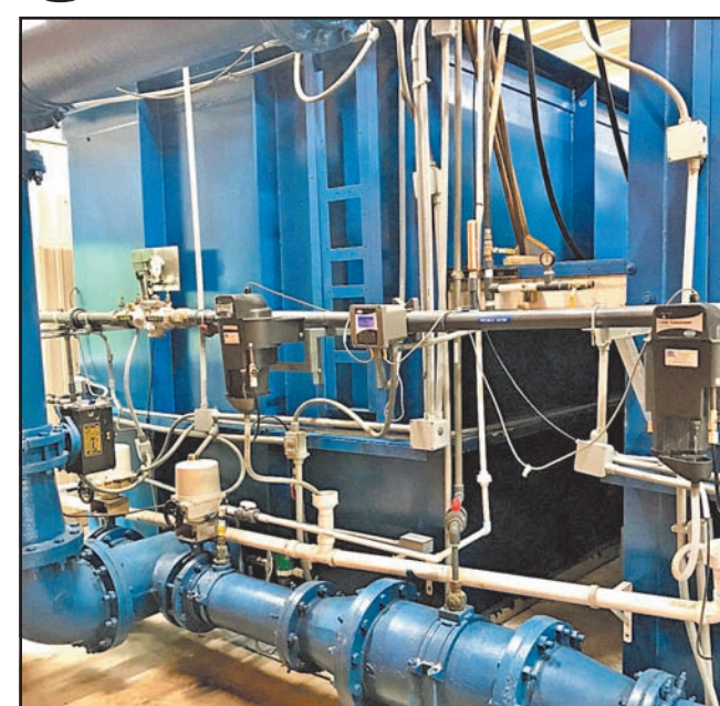
A view of some of the inner workings in the Hiawassee Water